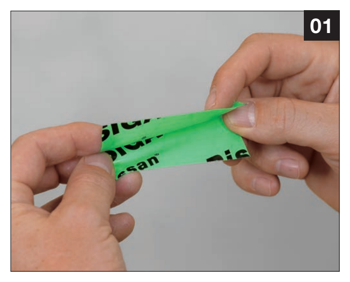
• Crease Rissan lengthwise