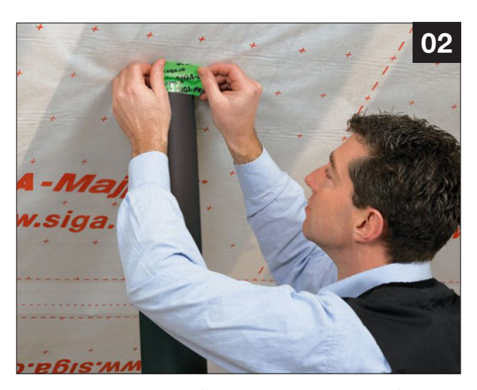
Apply Rissan half to the pipe and half to the the vapour control layer without tension